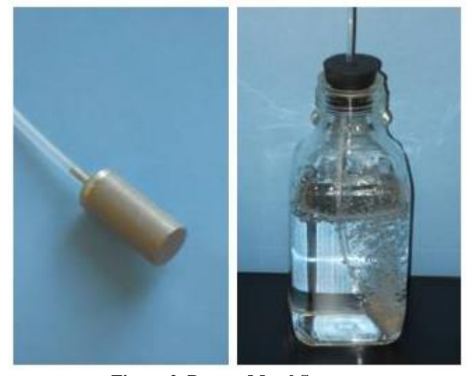
Figure 2. Porous Metal Sparger