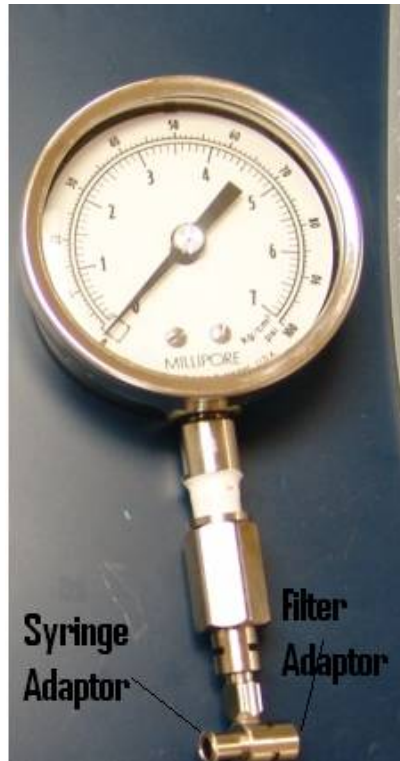
Figure 2: Pressure Gauge